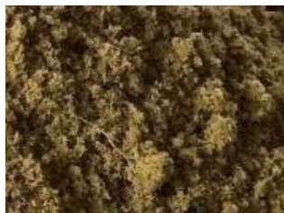
Poultry feather meal