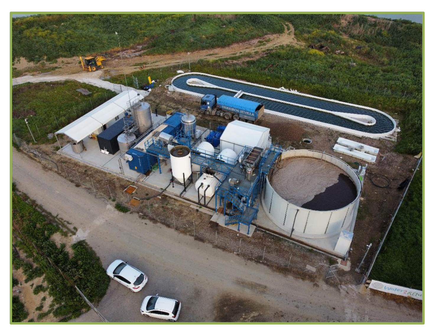
General overview – water line, sludge line, algae line, energy recovery module

Treatment capacity → 50 m³ per day (out of the 150 m³ of the slaughterhouse's daily flow).