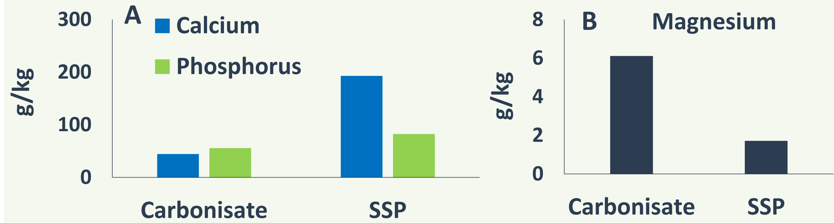
Figure 2. Calcium, phosphorus (A) and magnesium (B) content of recyclates

Larvae (6 replicates/diet) were reared on the experimental diets between days 1 to 18 post hatching. The larvae were harvested, weighed, and frozen for analyzing mineral content.