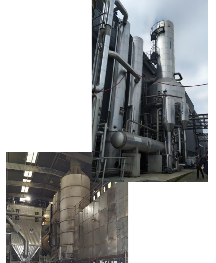
Cooperl site visit: digestate processing, organo-mineral fertiliser production from manure and animal by-products.

Current production at Cooperl Lamballe of solid organomineral fertilisers at is around 50 000 t/y only in granular form. 150 different formulas are manufactured according to customers' requests. Around two thirds of these are sold to farmers in nearby regions of France for vegetable, wine, or fruit production, and around one third is exported worldwide.