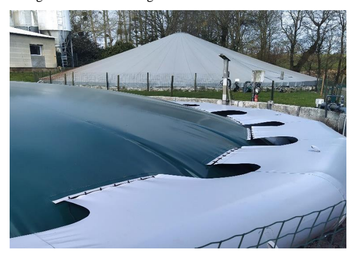
Couiclang pig farm site visit: covered manure storage with biogas collection

The raw slurry from the rest of the site is initially stored in tanks equipped for biogas collection from manure storage ( Nenuphar system), then separated into solid and liquid fractions. The solid fraction is transported to Lamballe to produce organo-mineral fertilisers, while the liquid part undergoes a biological treatment, where N content is decreased by 95% (to air as N_2 ). The resulting liquid is stored in a pond and then discharged with <500 mg/l N and some K. This solution is currently being substituted by a new one, to recover nitrogen rather than losing it to air.