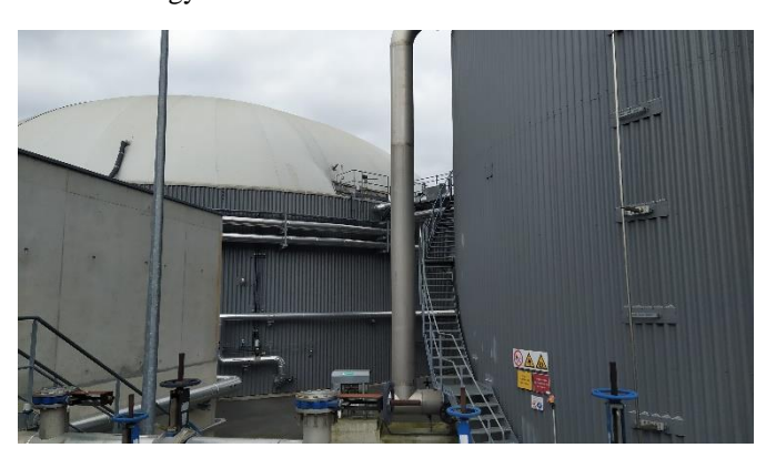
Cooperl site visit: anaerobic digesters