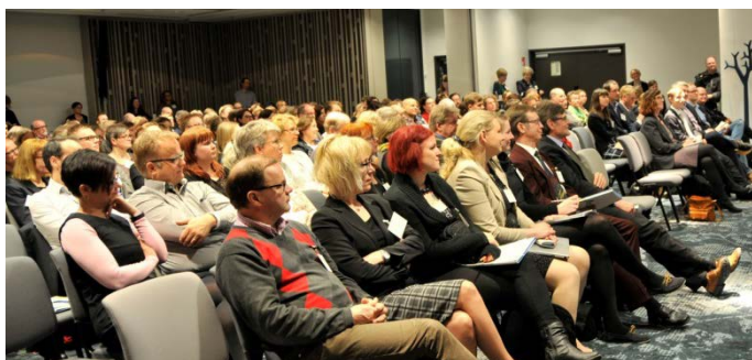
Launch of Finland Government Key Project national nutrient recycling programme and "Recycle Nutrients for Clear Waters" seminar 19-20 April 2016, Helsinki http://mmm.fi/en/recyclenutrients and https://www.youtube.com/user/mmmviestinta

'Nutrient recycling into practice', Finland Ministry of Agriculture and Forestry and Ministry of the Environment joint press release, 19 th April 2016 http://www.ym.fi/en-US/Latest_news/Press_releases/EUR_124_million_for_the_experimentation_(38965)